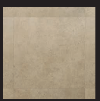
Ceramic Neutral SX5S4303