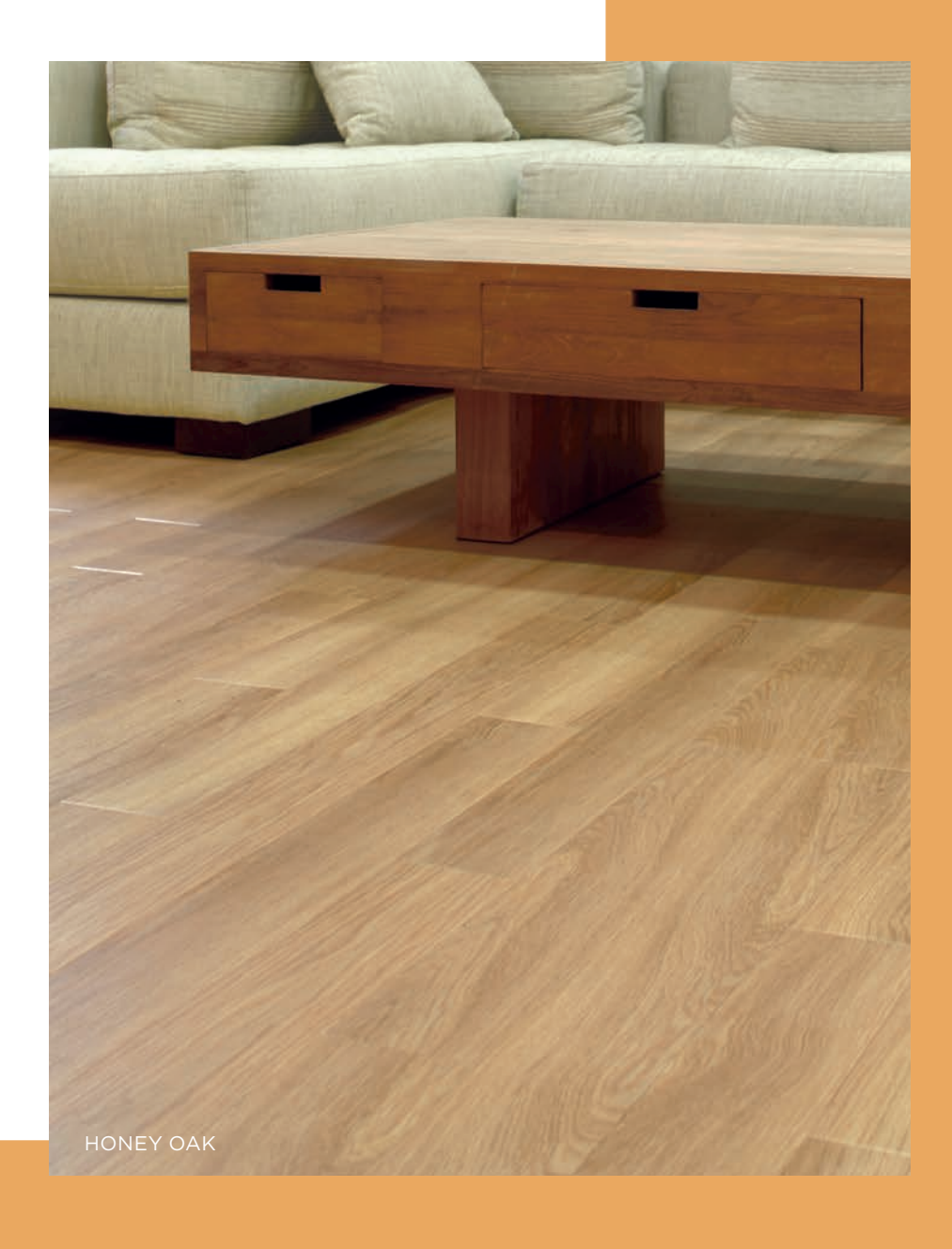
Urethane coating Bevelled edges 150 x 1000mm (5.9" x 39") Available from stock 1.80m² (19.375 sq ft) per box