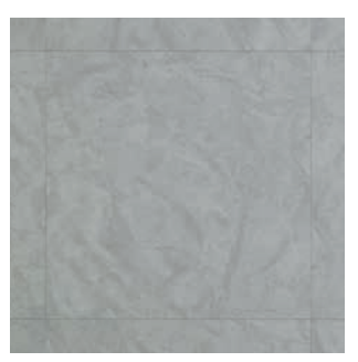
Ceramic Light SX5S1565