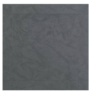
Ceramic Dark SX5S3566