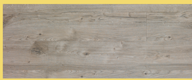
Sun Bleached Oak