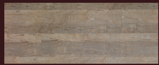
Bleached Elm SX5W2516