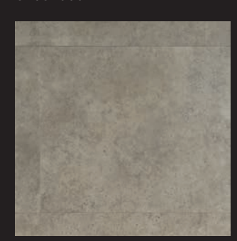
Ceramic Ecru SX5S3592

Ceramic finish Urethane coating Bevelled edges 450 x 450mm (17.7" x 17.7") Available from stock 2.025m² (21.79 sq ft) per box