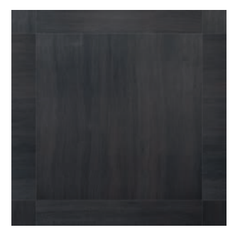
Linear Stone Black SX5S2405

Ceramic finish Urethane coating Bevelled edges 450 x 450mm (17.7" x 17.7") Available from stock 2.025m² (21.79 sq ft) per box