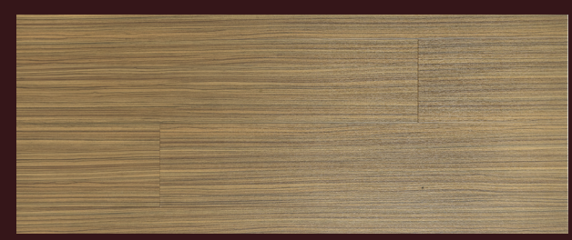
Zebra Wood SX5W5019