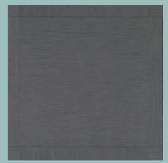
Urban Line Stone SX5A3170