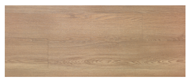
Pale Ash SX5W2518