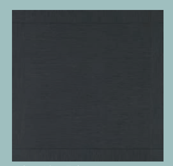
Urban Line Felt SX5A3271

Ceramic finish Urethane coating Bevelled edges 450 x 450mm (17.7" x 17.7") Available from stock 2.025m<sup>2</sup> (21.79 sq ft) per box